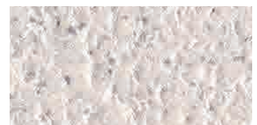
bocciardato / bush-hammered / gestockt