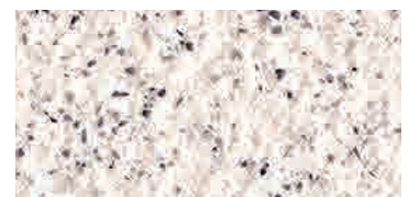
spazzolato / brushed / gebürstet